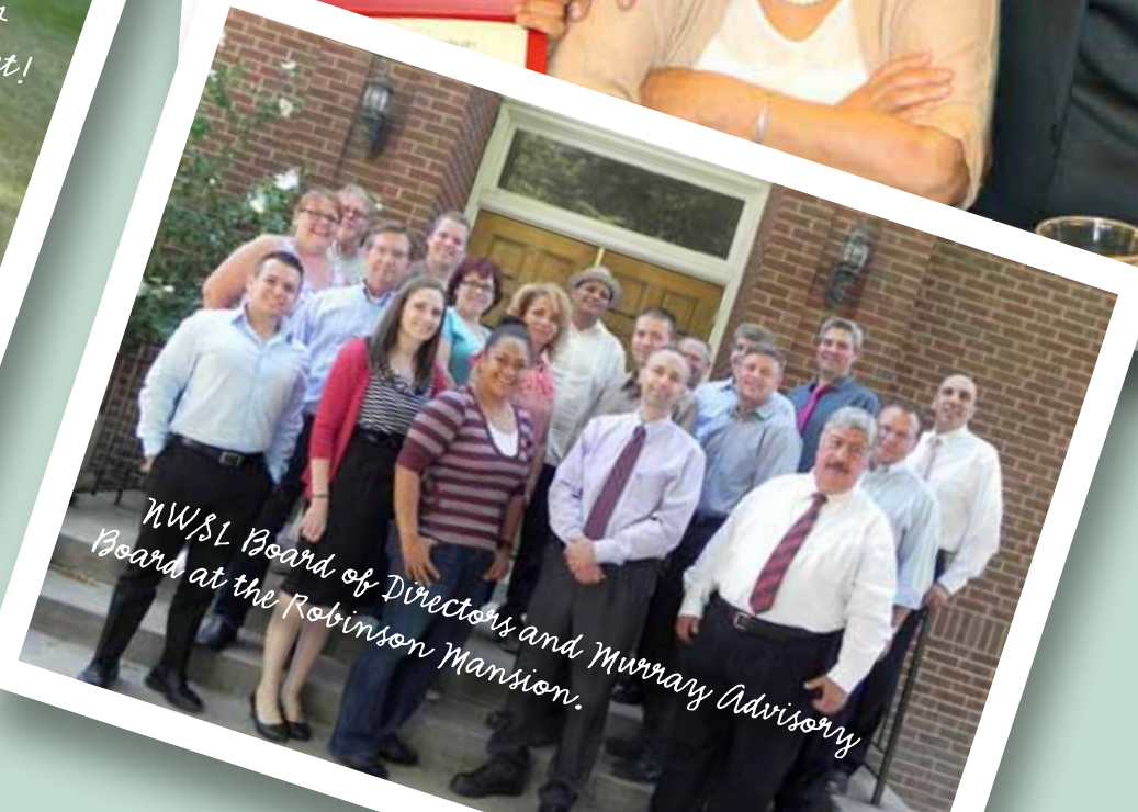
NW&L Board of Directors and Murray Advisory Board at the Robinson Mansion.