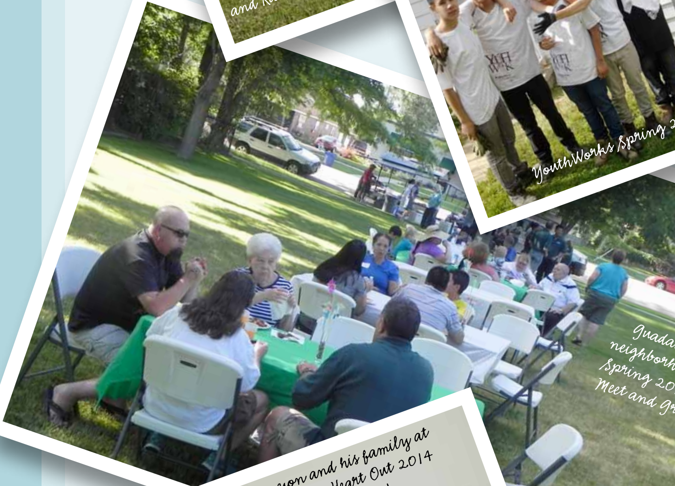
Guadalupe neighborhood Spring 2014 Meet and Greet