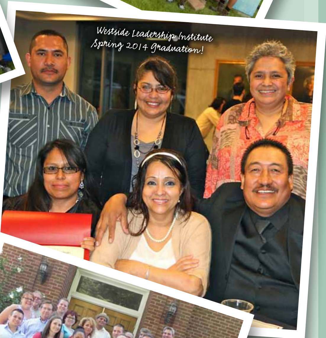
Westside Leadership Institute Spring 2014 Graduation!