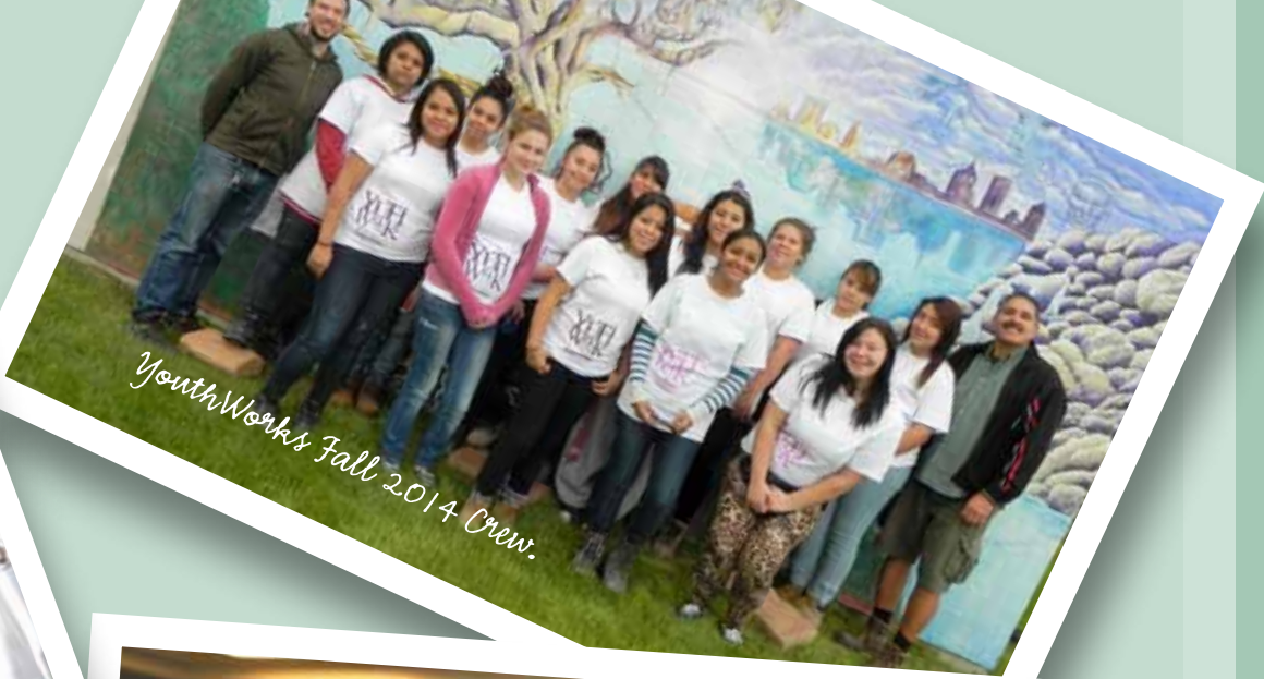
YouthWorks Fall 2014 Crew.