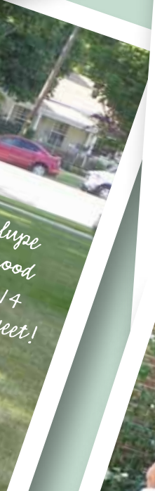
Lupe ood 14 reet!