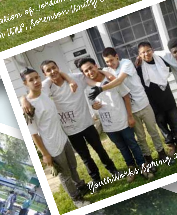
YouthWorks Spring 2014